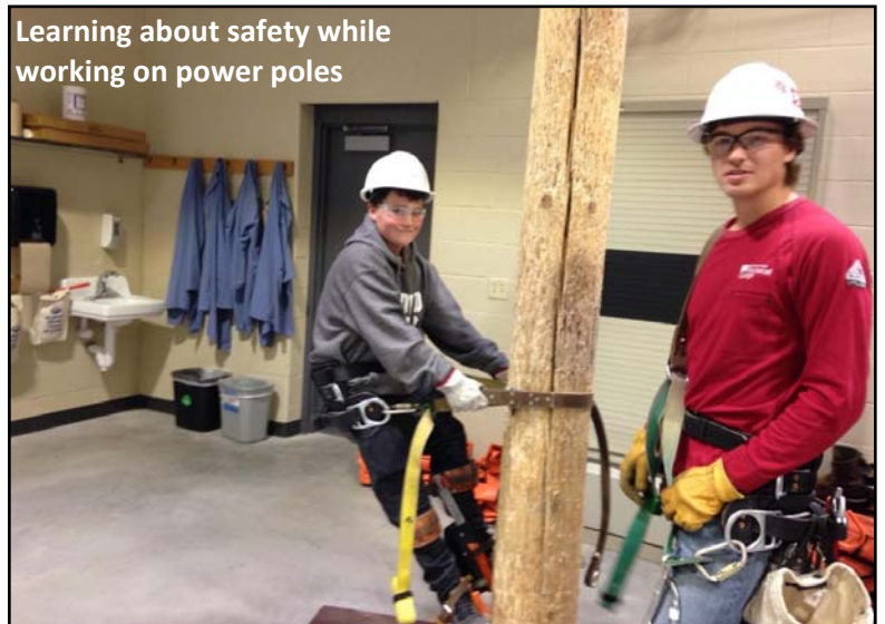
Learning about safety while working on power poles