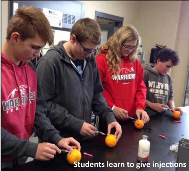
Students learn to give injections

The 8th grade year is off to a great start! Students are learning about reflections, rotations, translations, and angles of polygons in math. They are reading short stories and learning about the elements of a short story in English. In history, they have studied early peoples, explorers, and settlements of North America. Science has been filled with learning about classifying organisms and using a microscope. Most recently in phy ed, they have been working on their volleyball skills.