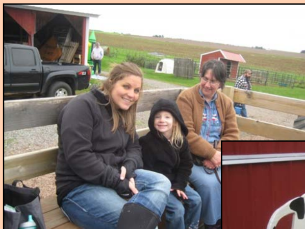
4K Visits the

Eighth grade students have had a little different experience. For the second year, our eighth grade students have been paired with students from the junior class who make up the Teen Leadership Council (TLC). The TLC students have been paired up with small groups of eighth graders, to begin to establish relationships between our students as they move into high school. These students help lead the lessons for the eighth graders as well as keep in touch with them outside of class to answer questions, etc. In October, the high school students were also able to lead discussions about school spirit, participation in school events, and why those are important parts of our school community.